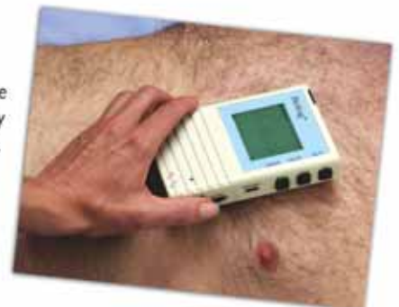
On-screen heart rate and ECG display in seconds.