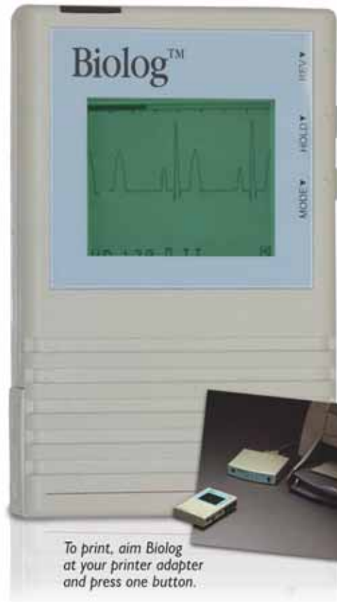
High resolution, backlit LCD display.