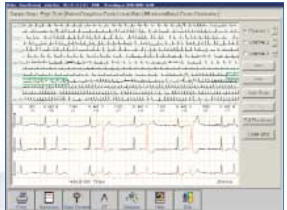
Simple, Intuitive, Easy to Use.

Finally, a Holter solution developed with the user in mind, while offering the utmost in patient care.