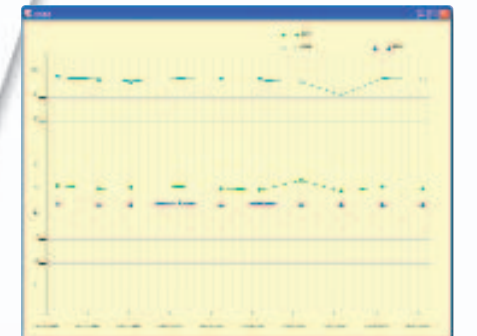
Powerful long term trending facility