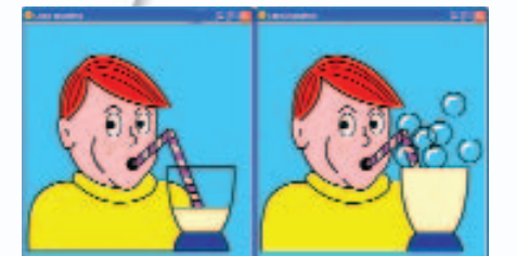
Milkshake kid child incentive screen