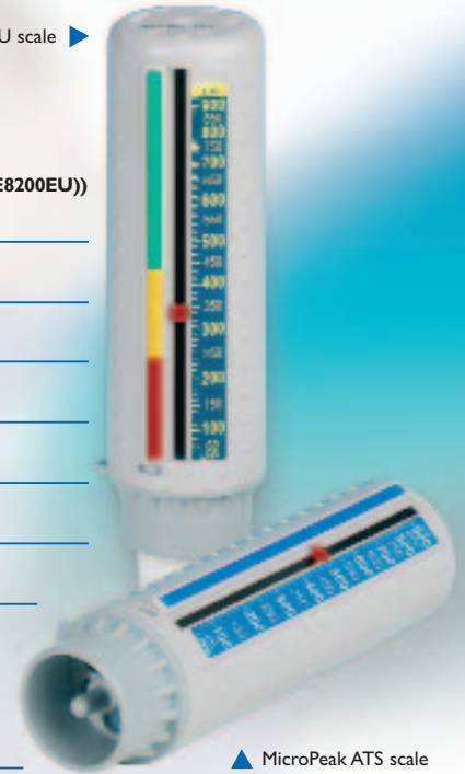
▲ MicroPeak ATS scale