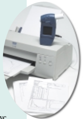
Print reports from Sensaire directly to a printer or through PC Print software.

*Specifications subject to change without notice.