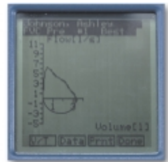
View real-time Flow Volume Loop graphs