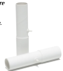
Sensaire's innovative mouthpieces are biodegradable, precalibrated and disposable.