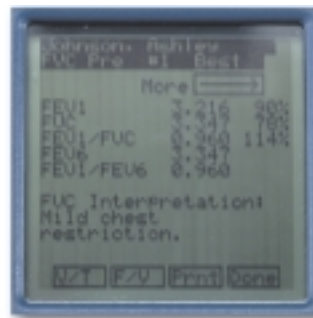
Test results are clearly displayed for easy interpretation