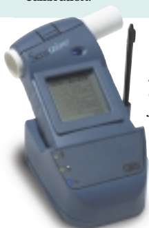
The base station allows you to easily dock and recharge your Sensaire.