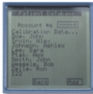
Access complete patient information with a touch of the screen