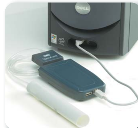
USB adapter included.