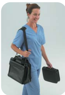
Complete mobile diagnostic workstation available from QRS includes: Vitals (BP, SpO2, pulse), ECG, Spirometry and Ultrasound*.