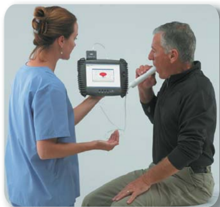
Compatible with off-the-shelf laptop, tablet and desktop computers.

Visit www.QRSdiagnostic.com for Specifications and System Requirements.