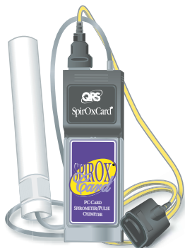
Also available: SpiroOxCard® combination spirometer and recording pulse oximeter.