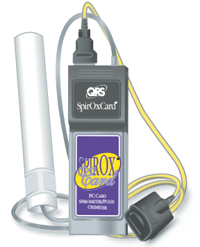
Also available: SpirOxCard ® combination spirometer and recording pulse oximeter.