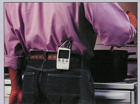
The lightweight, portable Trio*Stim is small enough to travel anywhere.