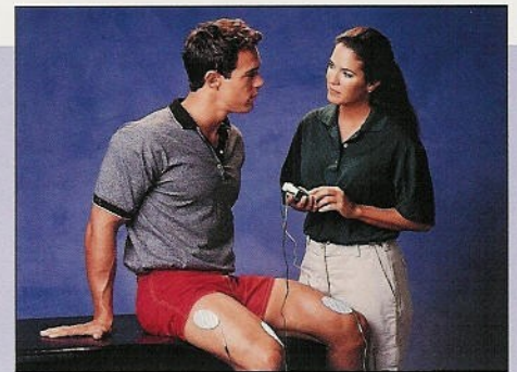
Three programmable modes provide unprecedented treatment flexibility from a portable unit.