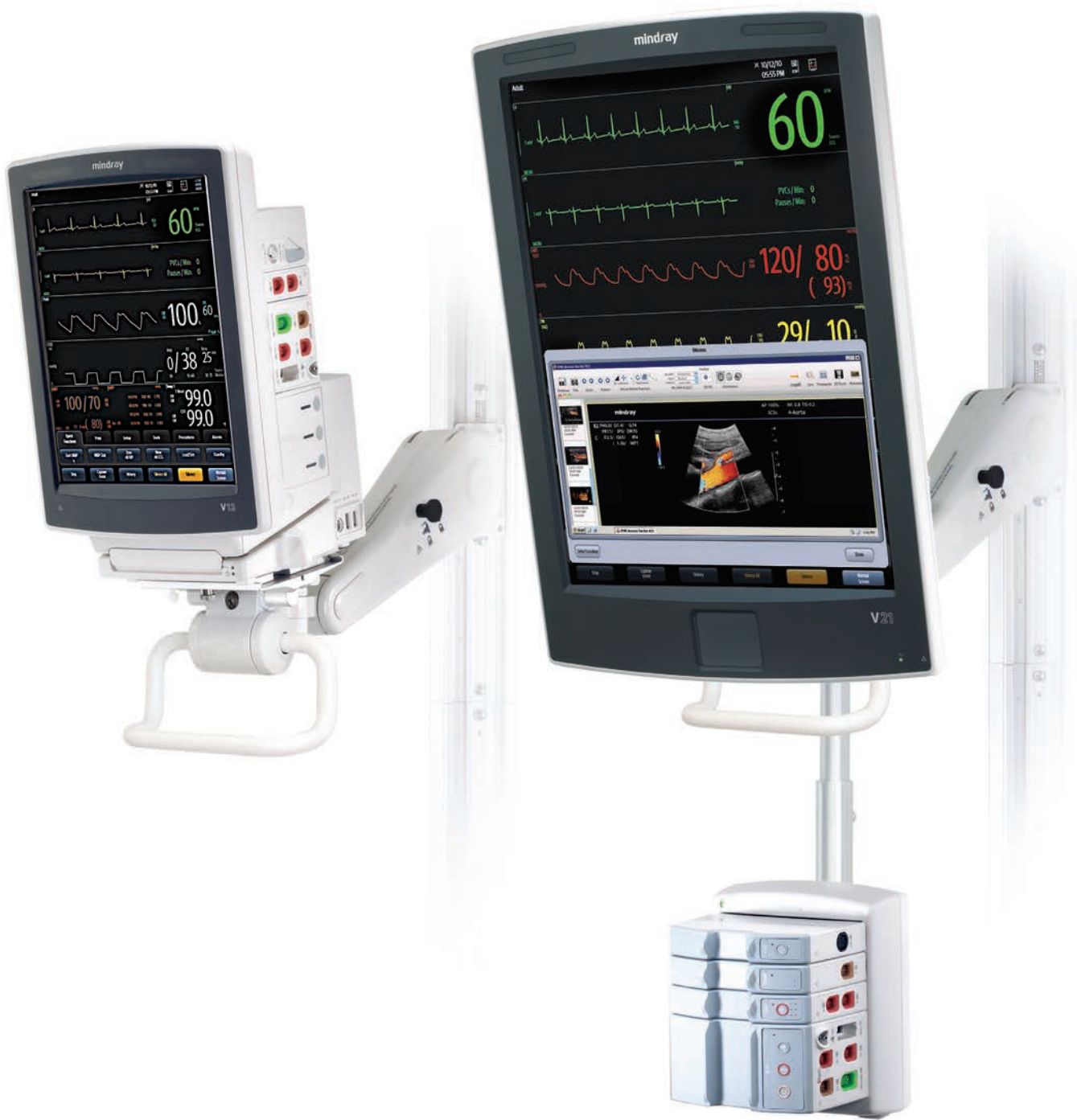
Available in two color TFT touchscreen display sizes: V12 and V21