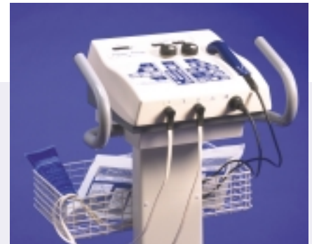
The model 93 or 94 cart offers a sturdy treatment platform for heavy clinical use.