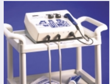
The economical model 73 cart includes 3 shelves to accommodate Mettler units and accessories.