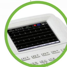
Large Color Screen