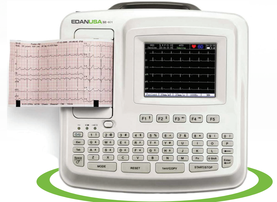
SE-601C 200 ECGs Internal Memory (5.7 inch multi-color LCD display)