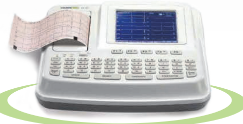
SE-601B 100 ECGs Internal Memory (5.7 inch single color LCD display)