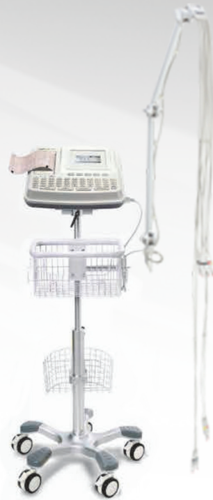
SE-601A 50 ECGs Internal Memory (3.5 inch single color LCD display)