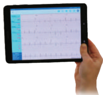
12-lead PCA 500 detects