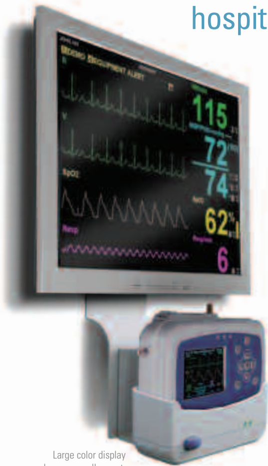
Large color display shown on wall mount.