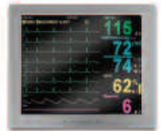
Choose from 4- or 9-waveform display modes and easily see vital signs numerics, waveforms and alarm limits.

The Propaq LT conveniently connects to a large color display with the choice of 4- or 9-waveform display modes, making it perfect for bedside or procedure applications. And with tabletop and wall mounting options, you have the flexibility to use your large color display where you need it most. Off-the-shelf displays may be purchased separately for use with this option.