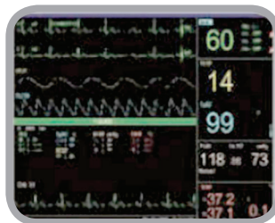
OxyCRG for Neonate