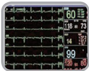
3/5-lead ECG Analysis