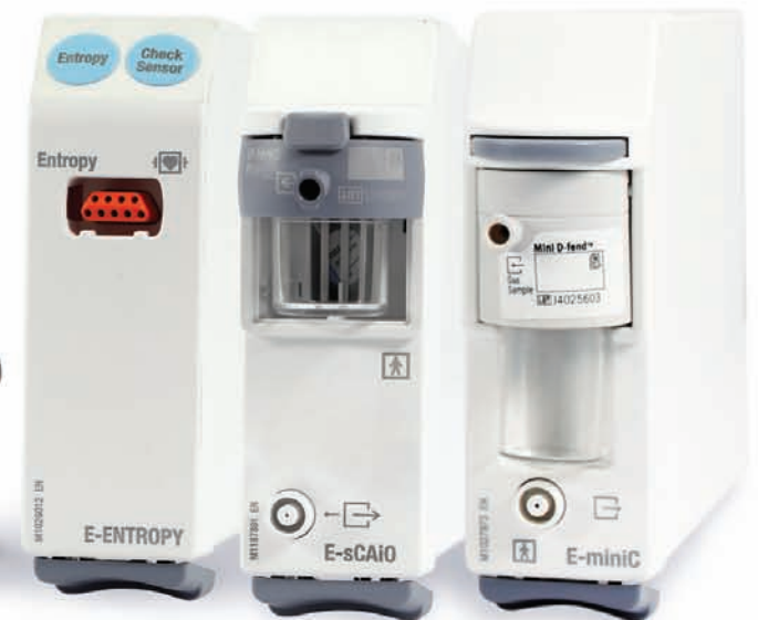
CARESCAPE* Respiratory Modules

The B40 Monitor makes it easy to acquire accurate patient data to support timely decision-making.