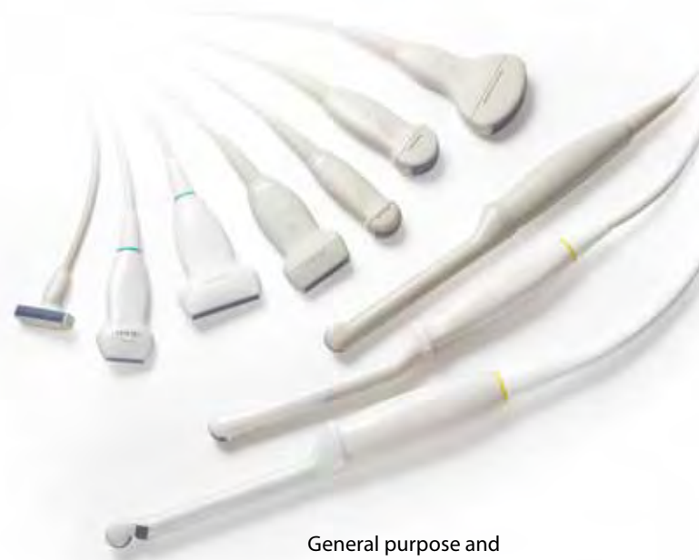
General purpose and specialty transducers