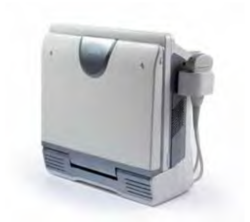
Compact and lightweight for enhanced mobility