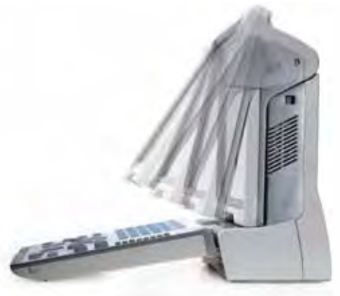
Tilting LCD display allows easy viewing