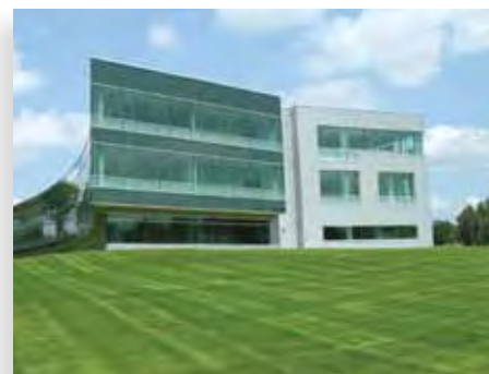
Mindray DS USA, Inc. U.S. headquarters in Mahwah, NJ

Learn how we can help you maximize your resources with some of the most advanced and affordable devices in the industry. For more information about Mindray products and services, visit www.na.mindray.com .