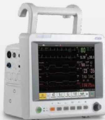
Guardian Lite 10.4" Color TFT-LCD Touch Screen