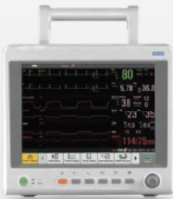
Guardian Pro 12.1" Color TFT-LCD Touch Screen