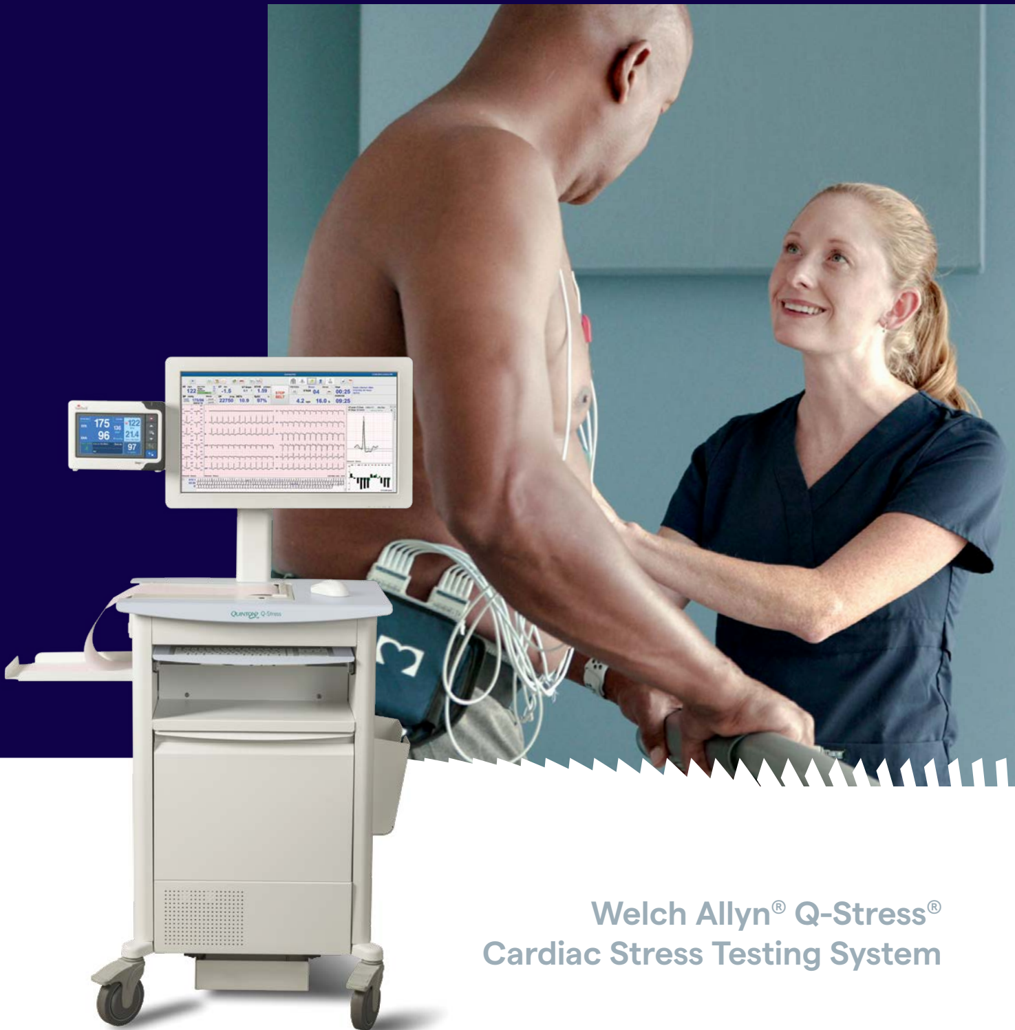
Welch Allyn ® Q-Stress ® Cardiac Stress Testing System