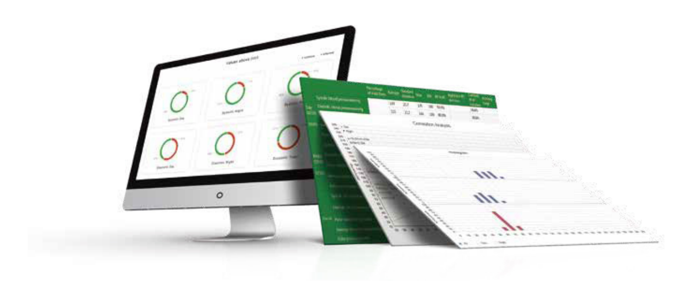
Pie Chart Analysis

With the aid of the GT-101s powerful analysis software, the clinicians can have a better insight into the variation of patient's blood pressure within 24 hours, easily identifying the periods when the blood pressure values are above limits. The informative statistical table provides a clear presentation of the measurement summary throughout the day.