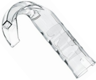
Pediatric Size 2 Part Number: YLO-IIIB2