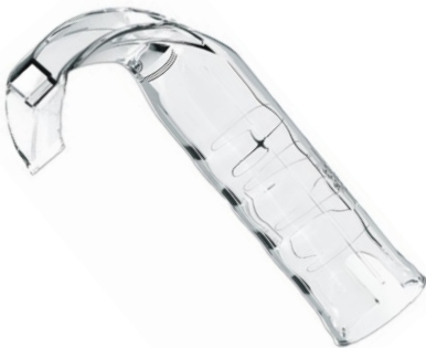
Large Adult Size 4 Part Number: YLO-IIIB4