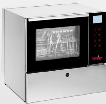
TIVA2 TD Counter Top Washer