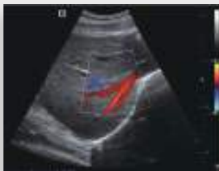
Color Flow of Liver

With powerful user-defined presets, auto image optimization, iWorks (scan protocol), and patient information management system, the Z60 Ultrasound System makes it fast and easy to complete exams. The System also provides onboard reporting and DICOM 3.0 which greatly improves your workflow without compromising diagnostic accuracy.