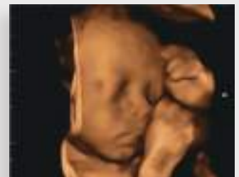
3D of Fetal Face