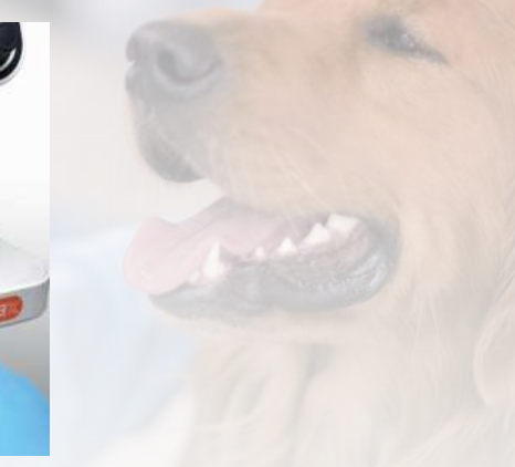
*The VetaBain system and the monitor bracket are optional components